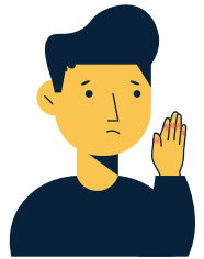
Red, purple or blueish lesions (spots) on the feet, toes or fingers without clear cause

If yes, stay home and contact 811 to be screened for testing for COVID-19.