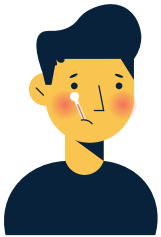
Fever (i.e. chills, sweats)