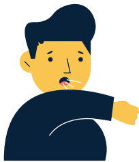
Cough or worsening of a previous cough