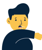
Cough or worsening of a previous cough