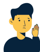
Red, purple or blueish lesions (spots) on the feet, toes or fingers without clear cause

If yes, stay home and contact 811 to be screened for testing for COVID-19.